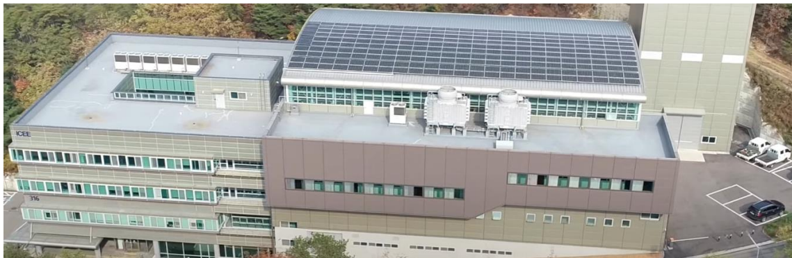
Extreme Performance Testing Center (EPTC), Seoul National University

Immediately after the group photo session, participants will take a campus tour in three groups: A, B, and C. All groups will tour SNU museum, library, and EPTC in sequence. Please follow Staff's guidance and check the list of groups below.