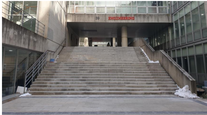
Front stair Bldg.39

All participants are strongly encouraged to take group photos after the design competition.